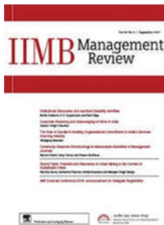
IIMB Management Review (Official journal of IIM Bangalore, ABDC-B category)

(Post-Conference Events | Online, October – November 2024 | Invited papers only)