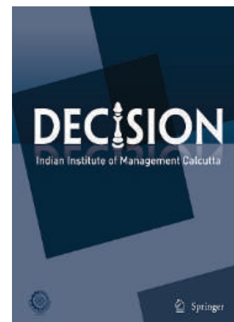
DECISION (Official Journal of IIM Calcutta)